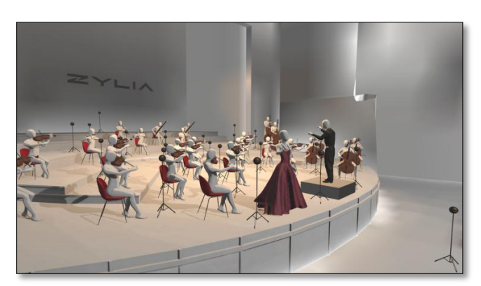
Figure 3: ZYLIA Concert Hall for Oculus VR headset

to share their work. ZYLIA 6DoF Navigable Audio solution was developed specifically to help them deliver a truly immersive experience with unrestricted freedom of movement through the recorded 3D audio space — so exactly a type of content Metaverse is looking for.